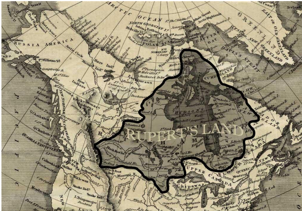
Figure 4: “1818 Rupert’s Land Map,” Rupertsland Institute: Metis Centre of Excellence Website . 10