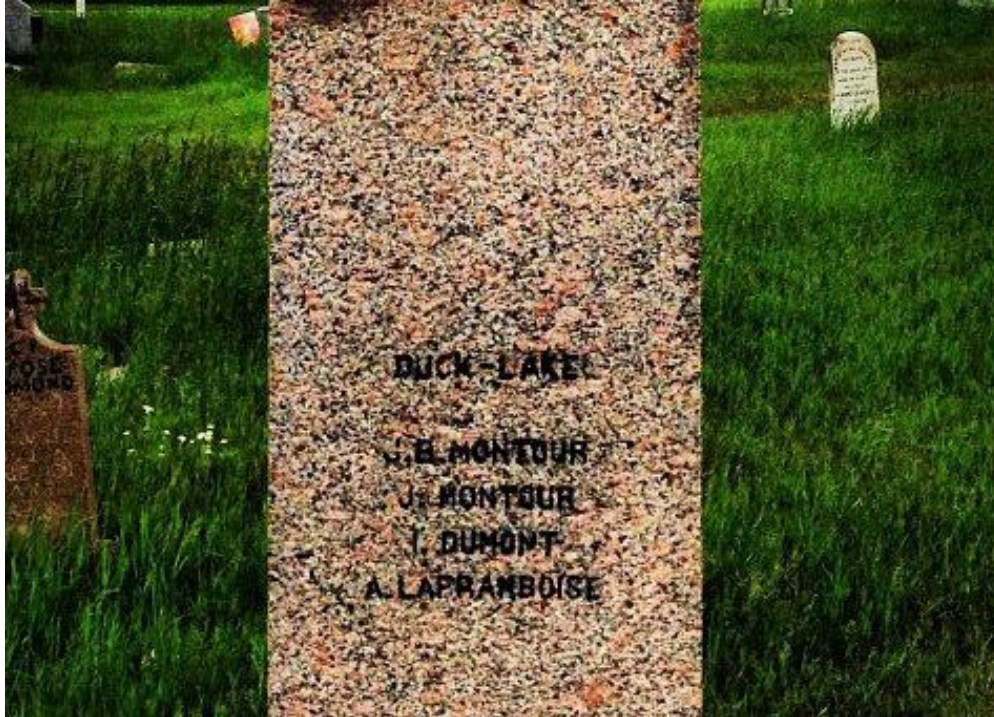
Figure 10: Grave of the Montour men killed in the Northwest Resistance, Batoche.