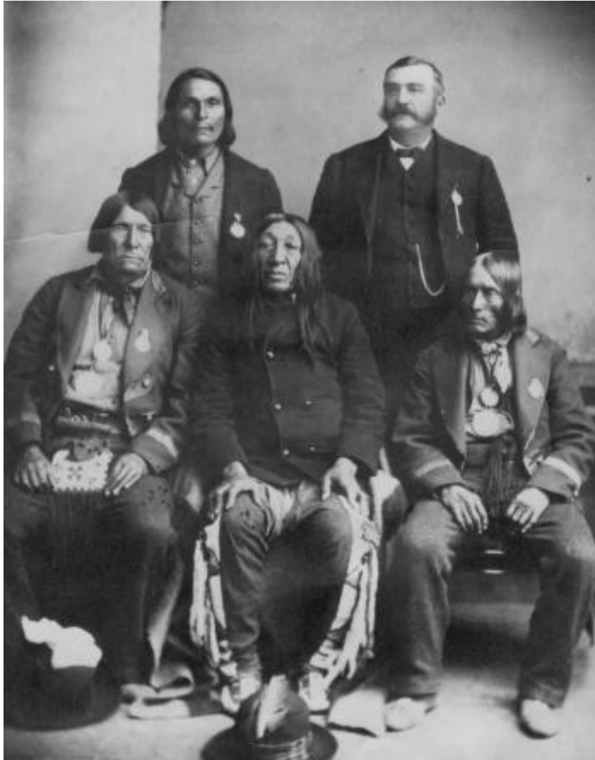
Figure 6: Ahtahkakoop (Chief Starblanket) bottom left and Pierre Belanger (Chief Mistawasis) bottom right