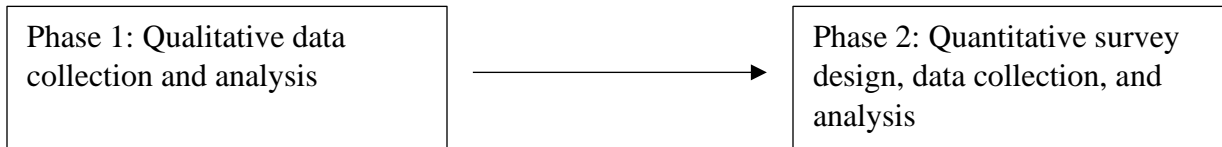
Figure 1. Research Plan

A mixed methods design is appropriate for exploring and testing the topic of motivation and peer pressure. In this study, mixed methods will be defined as the inclusion and integration of both qualitative and quantitative data collection and analysis. By collecting qualitative data prior to quantitative data through an exploratory sequential design (Creswell, 2015, p. 6) we can first gain a deeper understanding of what might motivate people to instigate deviant acts by others, as quantitative work is not suited to address this. This design is beneficial for building measurements for variables in the survey that took place in the quantitative phase of the study. If the survey were to be created without prior exploration, then the survey measures might not accurately represent the main reasons people may be motivated to persuade others in deviant processes.