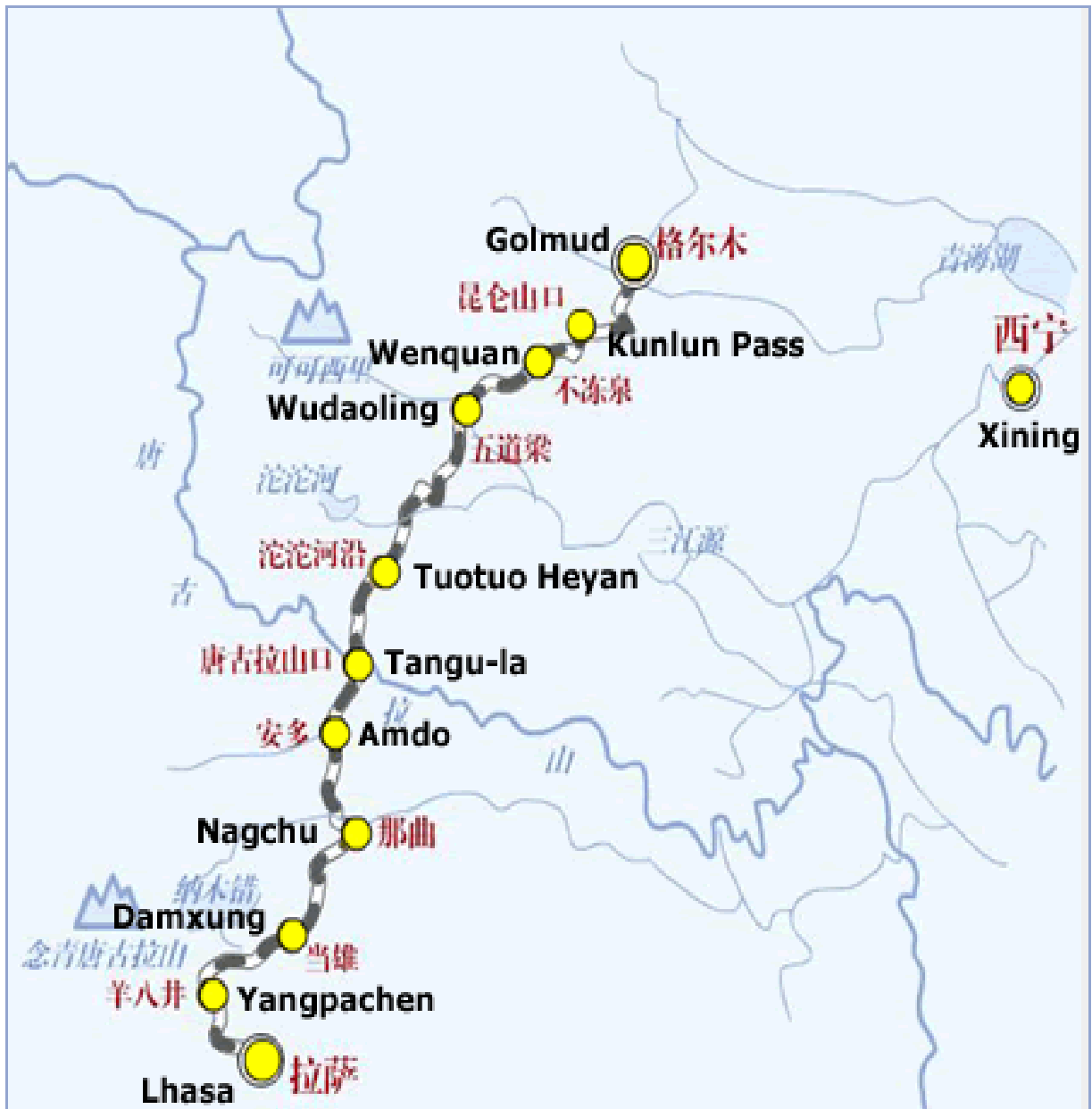
Figure 3.1.2.2: The Route of the Qinghai-Tibet Railway from Golmud to Lhasa