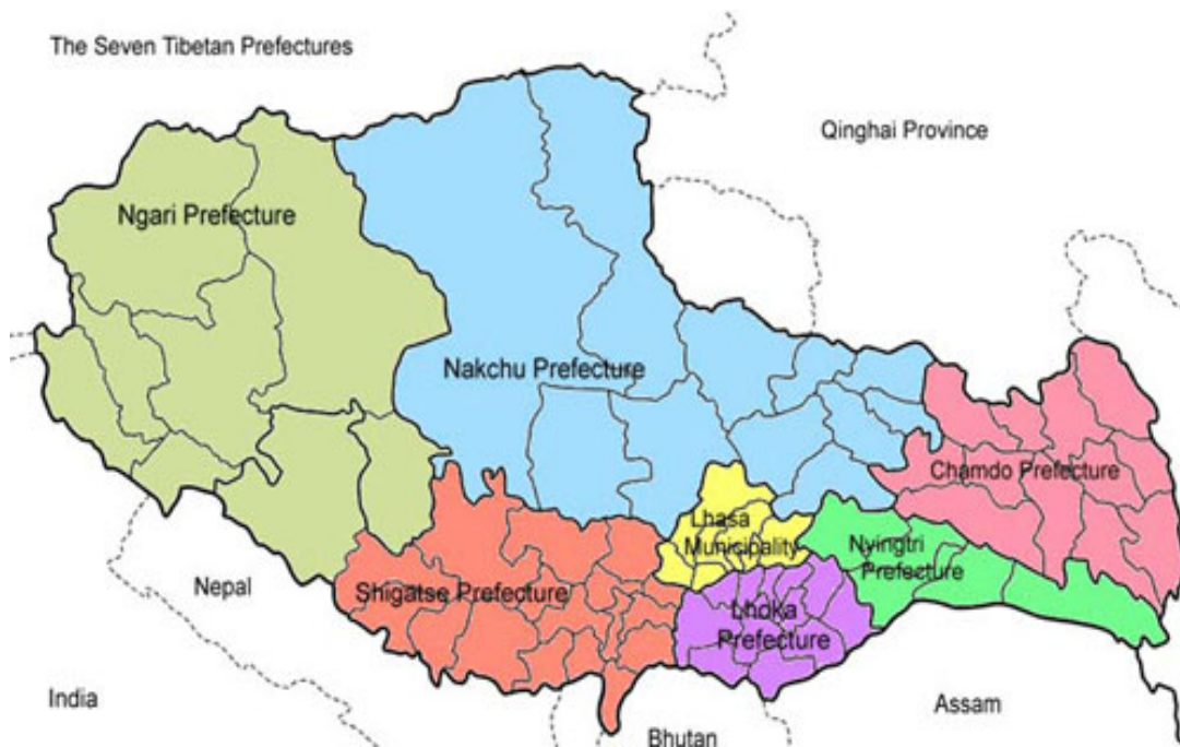
Figure 3.1.2: Administrative Map of Tibet