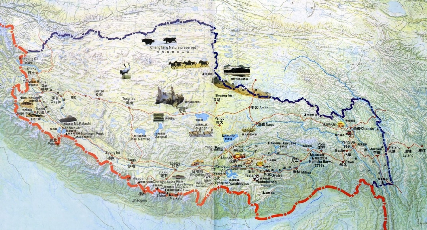
Figure 4.7.2 Tourism Spots Map of Tibet