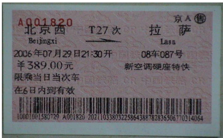
Figure 3.1.2.4: Train Ticket