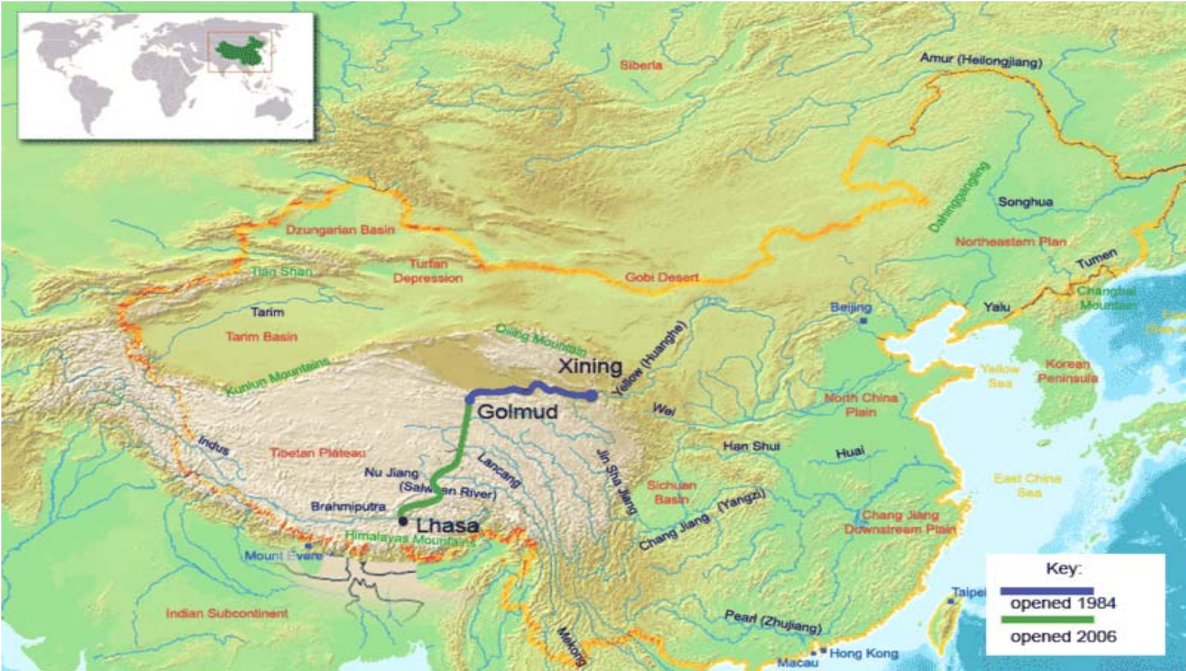
Figure 3.1.2.1 Location Map of the Qinghai-Tibet Railway