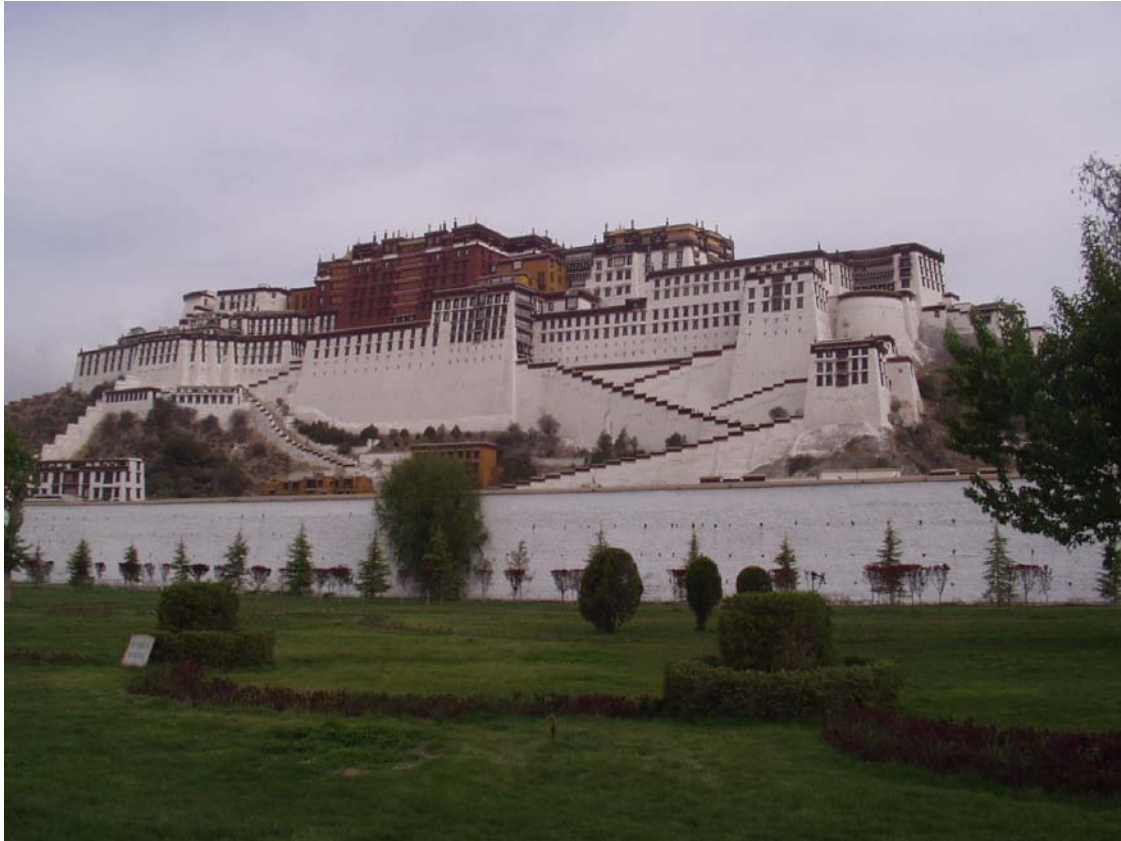
Figure 2.2.1: The Potala Place in Lhasa

operation and management dealing with the huge increase in travelers in Tibet, in terms of the quality service, market regulation and tourism safety issues (Xinhua, 2007.4.5).