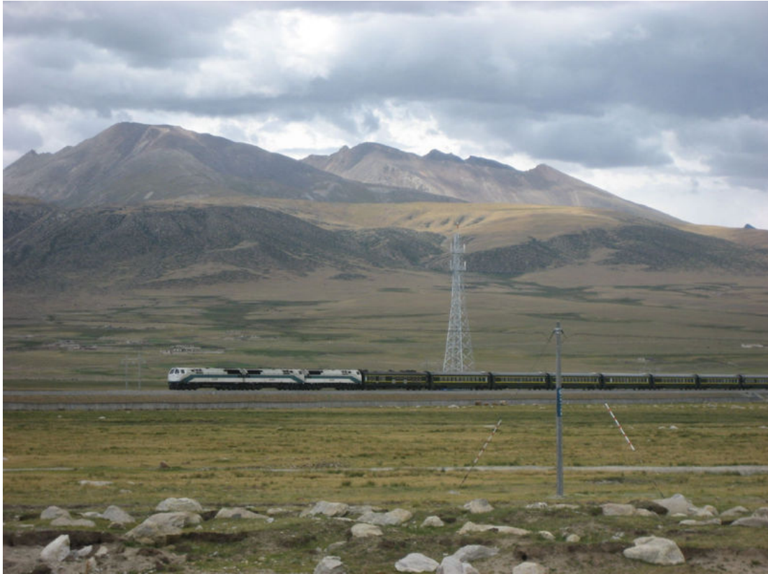
Figure 3.1.2.3: The Train Running Through Tibet Plateau