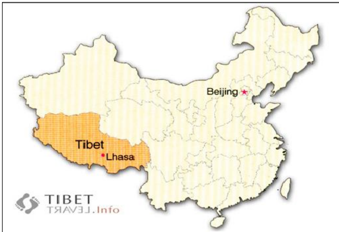
Figure 3.1.1: The Location of Tibet in China