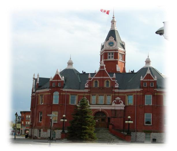
Figure 3.2 Stratford City Hall