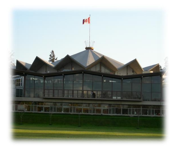
Figure 3.1 Festival Theatre